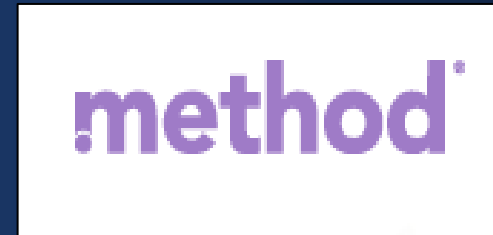
Method Cosmetic Products