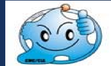
CMC/CLA Auto Parts Supplier