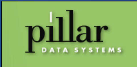
Pillar Data Servers and Network Devices