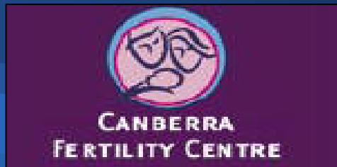
Canberra Fertility Center Hospital